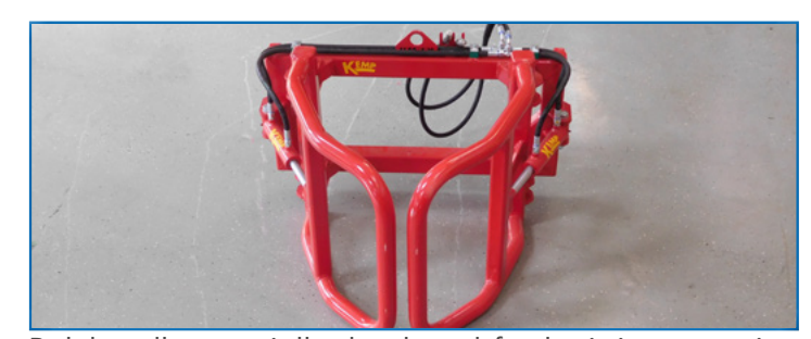
Balehandler specially developed for logistic processing of midibales.