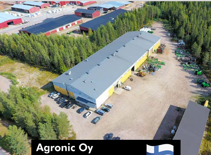
Agronic Oy Haäpavesi, Finland