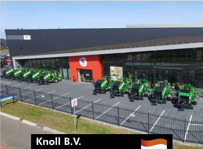
Knoll B.V. Staphorst, Holland

A strong cooperation of more than 25 years brings out the best in us. Together we are successful in the development of durable and reliable machines that create added value for our customers! A good cooperation ensures perfect machines and satisfied customers!