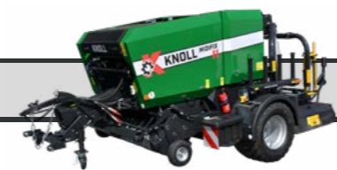
KNOLL MidiFix II