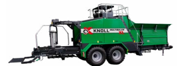
KNOLL MultiBaler XL