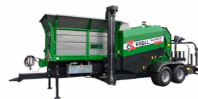
KNOLL MultiBaler 1220