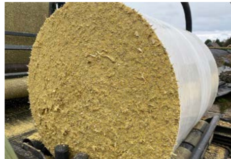
CCM ( corn cob scrap )