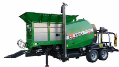
KNOLL MultiBaler 820