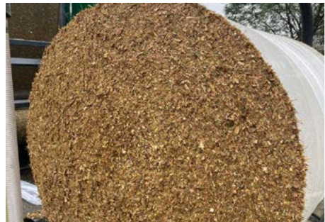
TMR ( Total Mixed Ratio )