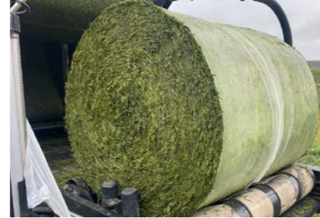
GPS ( whole plant silage )